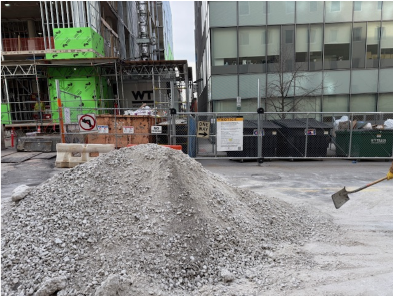
North side McElderry Street